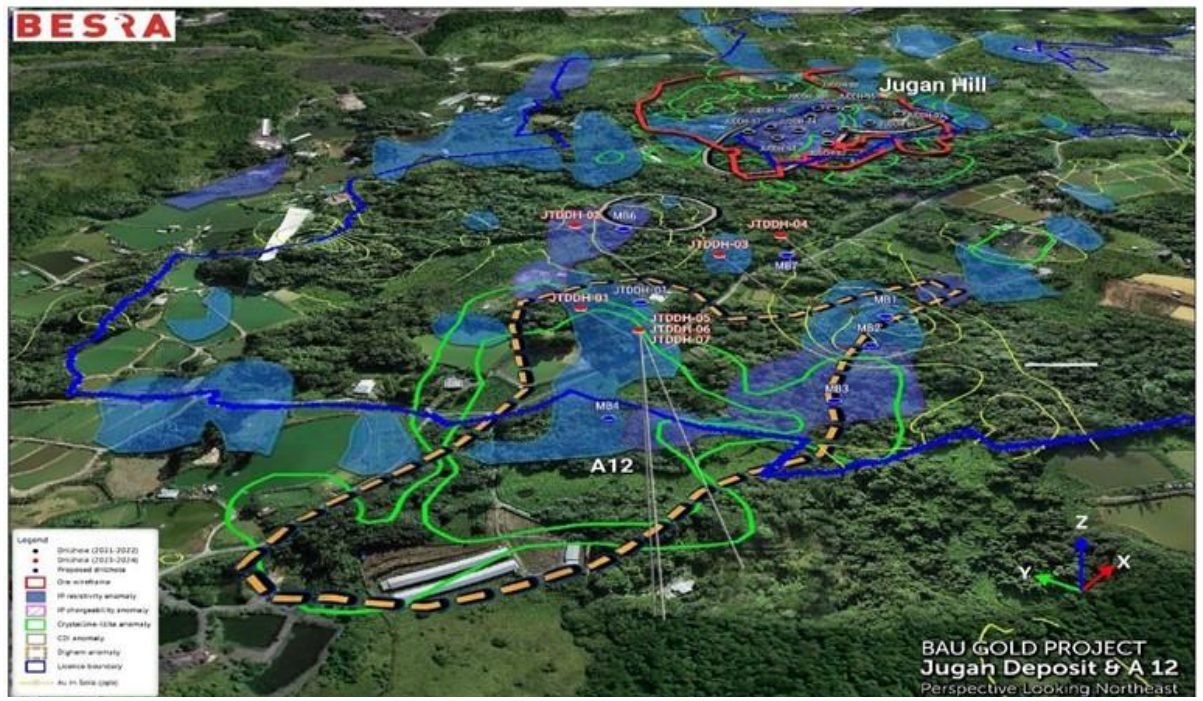
Figure 1: Distribution of IP geophysical anomalies (coloured pale blue) located to the west and northwest of the Jugan Hill, where the mineralised surface zone is highlighted in red. Green contours are boundaries of crystalline illite anomaly footprints.

The sources of these geophysical anomalies were attributed as mostly likely due to the presence of disseminated sulphides (high chargeability) and hydrothermal silicification (DIGHEM & Induced Polarisation ( IP ) resistors). Where coincident, these anomalies are potentially good indicators of the presence of alteration and sulphide zones.