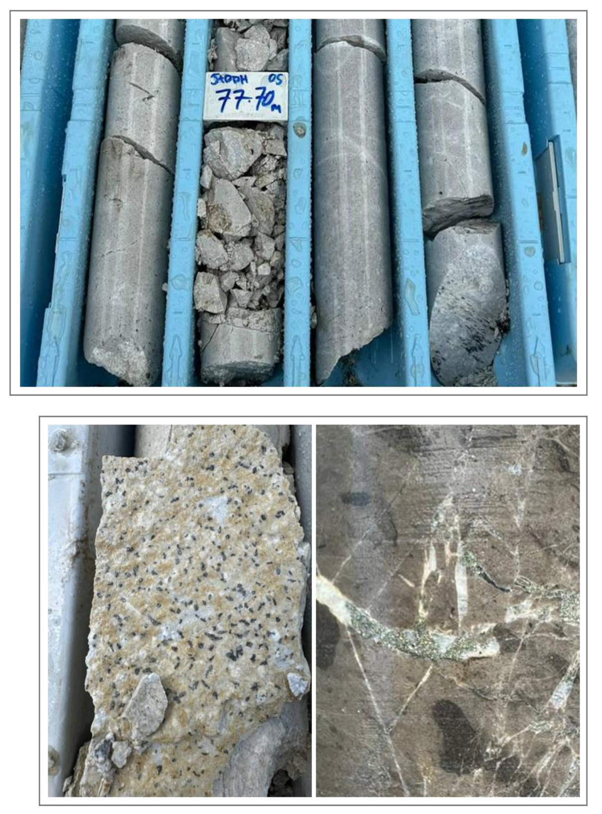
Figure 4 - Altered felsic intrusive (microgranodiorite?) with fine-grained sulphides occurring in fractures.

resistivity anomaly (Figure 5) as well as intense kaolin anomalies and the coincidence of crystalline illite concentrations from the HyChip. A fault is interpreted based on the contact of