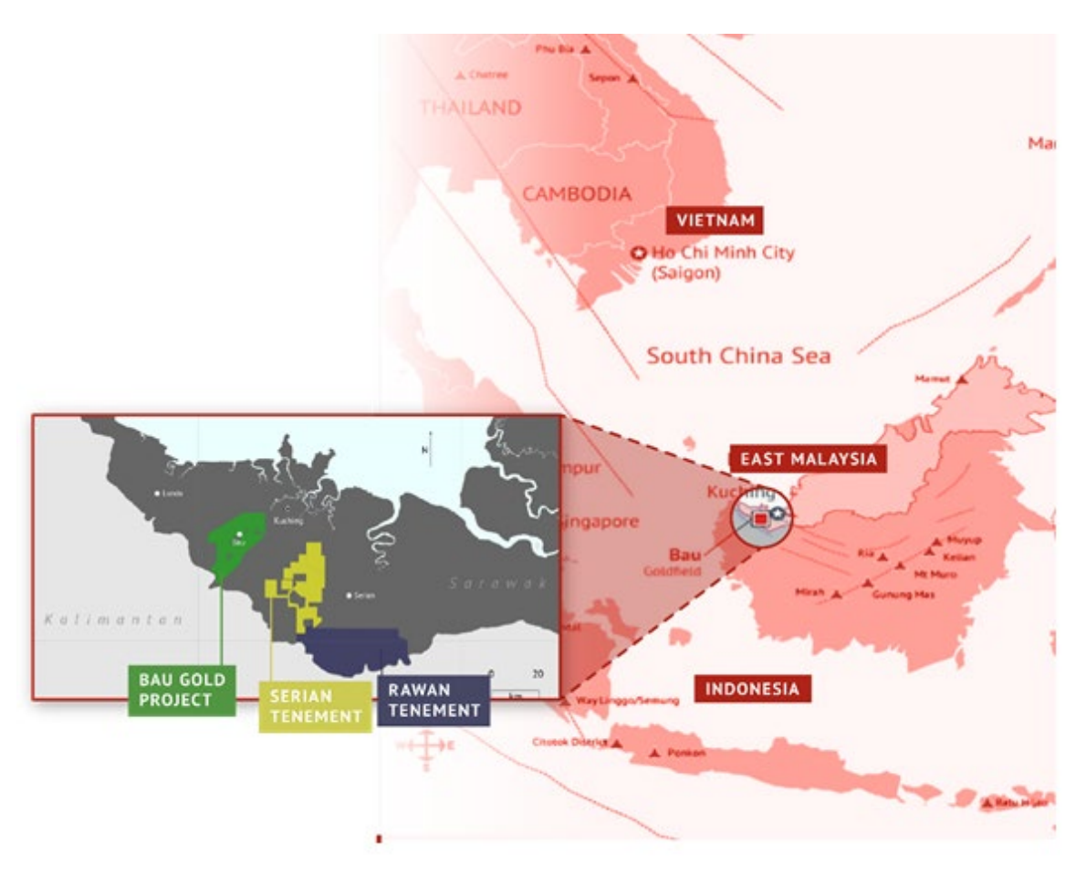
Figure 1 - Location of Besra's interests in mining concessions, Sarawak Malaysia.

With a population of 6,000 Bau, as the local service centre, is an important source for skilled labour, earth moving equipment, accommodation, general supplies and services. The main industries in the Bau district are limestone quarrying, fish farming, rice farming, palm oil and rubber production. Bau's main population groupings are Bidayuh, from the Dyak ethnic group, and Chinese who are mainly descendants of early miners who arrived in the mid to late 19<sup>th</sup> Century to exploit the gold and antimony deposits at Bau.